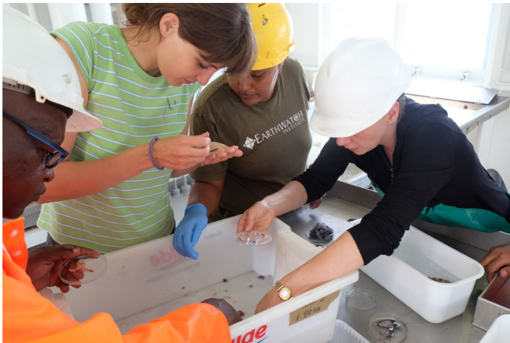
Sorting and determining species of mesopelagic fish, "Dr Fridtjof Nansen, 30. June 2015

We have done six stations so far where we have collected data of oceanography, biological production, such as chlorophyll, phytoplankton and zooplankton. We have also done three trawl stations where we have collected samples of mesopelagic fish. We have also sampled for plastic particles, and we have found small (microplastic particles) in almost all stations where we have sampled for these. We also observe large plastic debris floating on the surface, and we do systematic observations of these on the way.