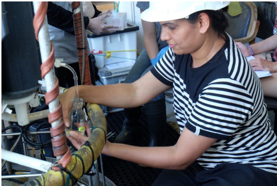
Sampling of water for the determination of chlorophyll.

Steaming towards south west, towards the next station. There are a lot of activities during the stations; CTDO, multinet, WP2, Mantatrawl, and trawling for pelagic and mesopelagic fish. The teams are very busy and eager to sample data of high quality.