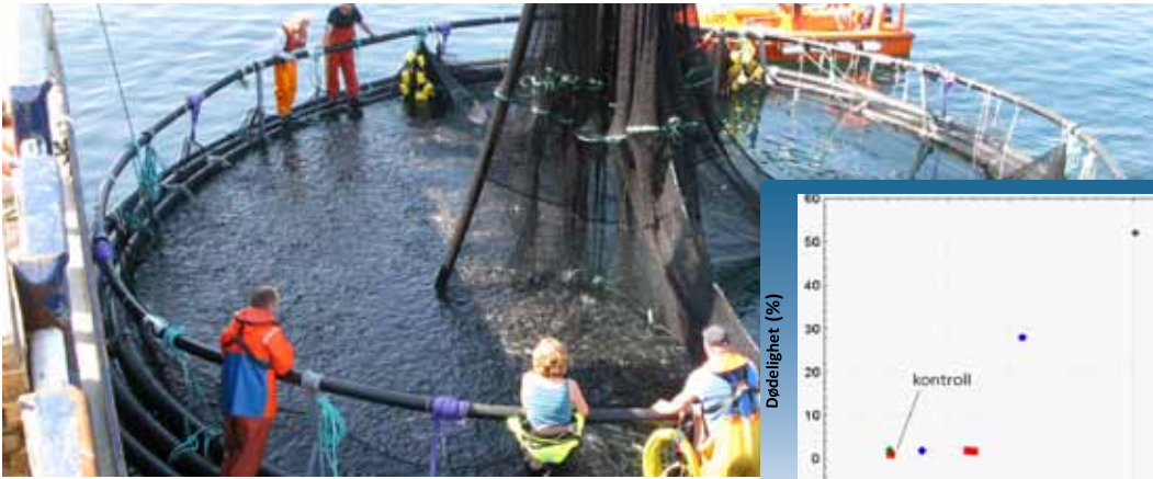
Figure 3: The herring are crowded by lifting the bottom of the net and simultaneously pushing them together from the sides.

were crowded to varying degrees (Figure 3). The aim was to simulate the crowding that occurs in the purse seine during sampling and pumping. Subsequently the cages were allowed to drift freely in the sea for an observation period of roughly five days. To monitor the condition of the fish, the cages were equipped with cameras and video links to the support vessel.